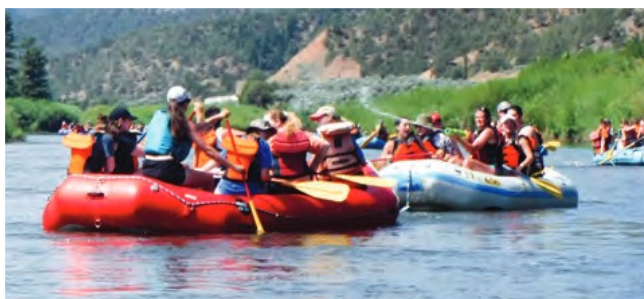
Each year, campers go rafting during Cooperative Youth Leadership Camp in Steamboat Springs, Colorado, which is scheduled for July 15-21, 2022.