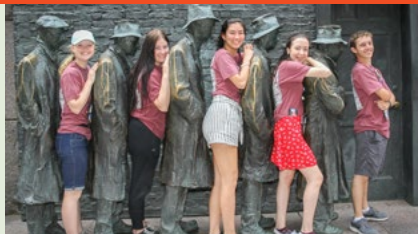
During Youth Tour, students visit many of the memorials around Washington, D.C.