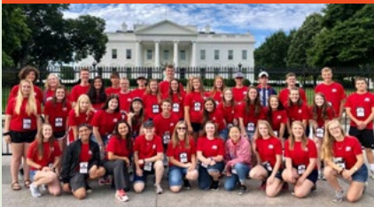
Youth Tour delegates pose outside the White House.