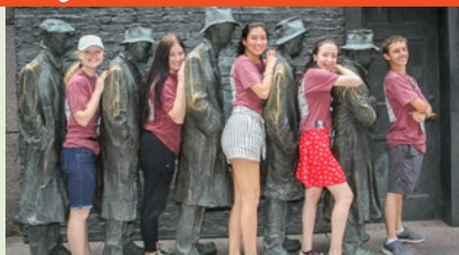
During Youth Tour, students visit many of the memorials around Washington, D.C.