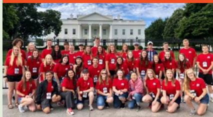
Youth Tour delegates pose outside the White House.