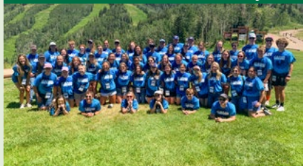
At camp, youth form a candy cooperative, learning the ins and outs of the co-op business model.