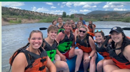
Campers go whitewater rafting during camp to test their communication and teamwork skills.