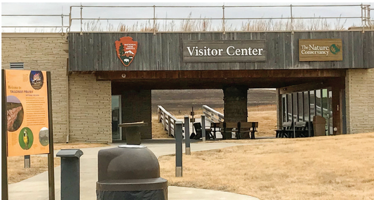
The visitor center is the perfect way to begin the trip.