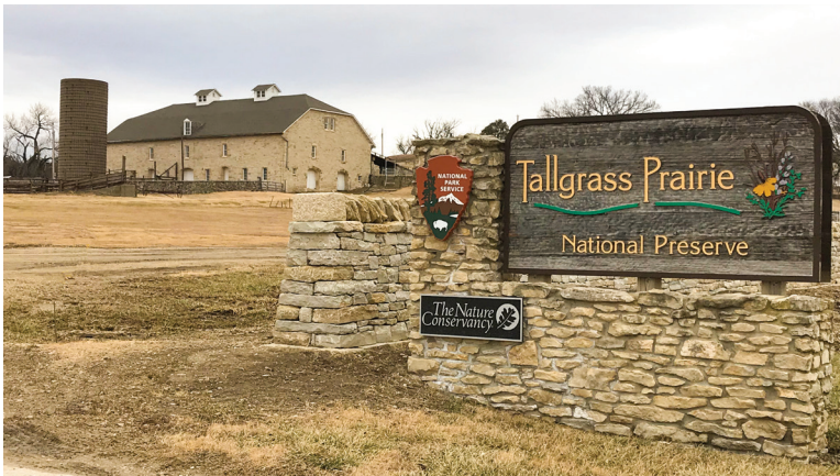
The 30,000 visitors annually to Tallgrass Prairie National Preserve contribute nearly $2 million to the regional economy, roughly within a 60-mile radius.

Just outside the visitor center are the grounds of the historic Spring Hill/Z-Bar Ranch. Visitors step back into the 1880s as they tour the limestone mansion, three-level limestone barn, scratch shed, chicken house, carriage house, curing house, out-house and icehouse. The Lower Fox Creek School, which was built in 1882, sits just 1 mile north of the